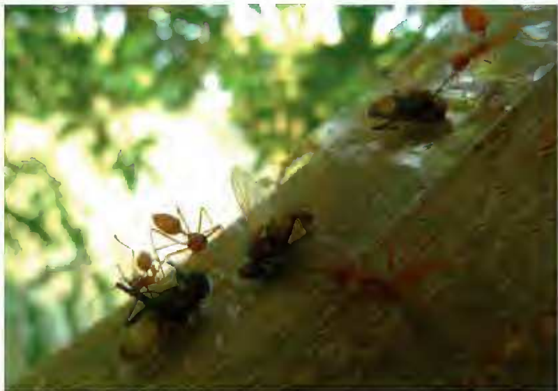
FIGURE 1: Oecophylla longinoda removing prey from tape pieces.

In order to estimate the biomass of the prey provided in the experiments, samples of at least 18 individuals of each prey type were collected in the field, dried for 24 hrs at 60°C, and weighed, and the average biomass was calculated. In cases with pieces of tape comprising a mix of prey types, an average biomass was estimated from the average biomasses of the used prey types (Lepidoptera, Hemiptera, and house flies ( Musca domestica )) (Table 1).